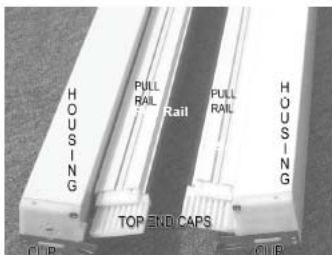
VERTICAL PARTS: TOP VIEW