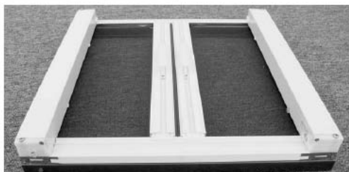
ASSEMBLED DOUBLE DOOR