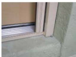
Make sure flush to housing