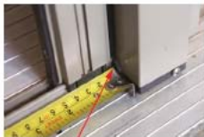
6b1: Measure from plastic edge