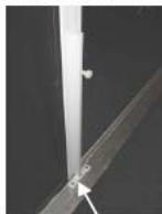
7b: Keeper installed

STEP 7: Install Stop Pin Keepers. Once the screen has been installed, you need to mount the keepers to the top and bottom of the door frame. OR drill a 7/16" diameter hole in the threshold and/ or the header instead of the keepers.