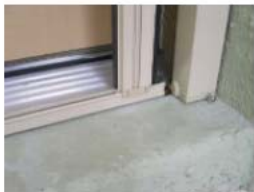
Fit into clip on housing

5f. Repeat the process for the lower guide rail.