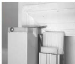
Top of housing on flat area of molding