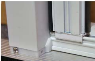
Bottom edge of housing on flat sill

Mount first screen housing, (what the screen retracts into) either LH or RH. The bottom edge of the housing should sit on top of the threshold of the existing door. The housing clip goes against the molding, mount the housing on a flat area of the molding. Check to be sure that there is a solid backing where the A or B screws will be placed at the top and bottom. If there is a step up to the door sill (at least 5/8" inch), then the housing can be mounted so that the lower guide rail is below the sill. Check that the existing bottom sill is level.